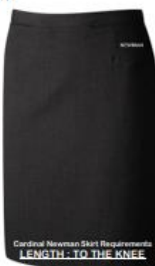
Black Straight Skirt Back Vent DL969 BADGED.