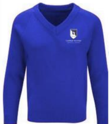
Royal Blue V-Neck 50/50 Mix Jumper Embroidered School Badge.