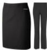
Black Straight Skirt Back Vent DL969 BADGED. Or Black, Straight Or Boot Leg Trousers.