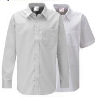
White Shirt Twin Pack Long Sleeve Or Short Sleeve.