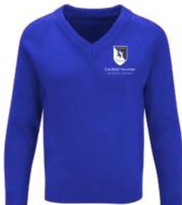
Compulsory Royal Blue V-Neck 50/50 Mix Jumper Embroidered School Badge.