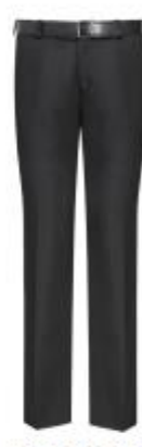
Black Pleated Trousers.