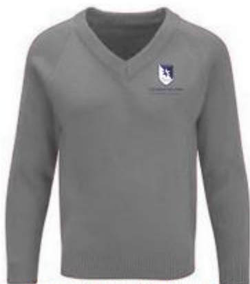
Mid Grey V-Neck 50/50 Mix Jumper Embroidered School Badge.