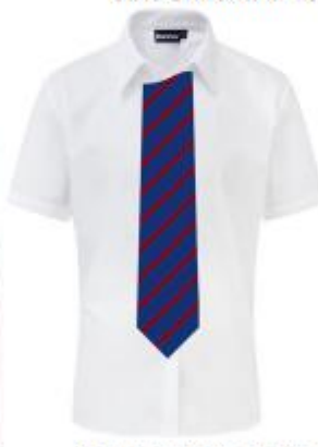
Top Button Blouse White Long Sleeve Or Short Sleeve. Twin Pack