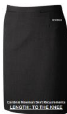
Black Straight Skirt Back Vent DL969 BADGED.