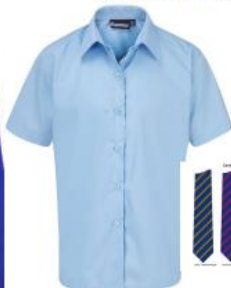
Top Button Blouse Light Blue Long Sleeve Or Short Sleeve. Twin Pack Year 7 YELLOW Stripe Tie