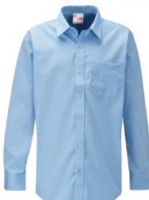
Light Blue Shirt Twin Pack Long Sleeve Or Short Sleeve.