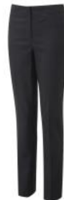
Black, Straight Or Boot Leg Trousers.