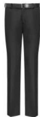
Black Pleated Trousers.