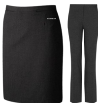
Black Straight Skirt Back Vent DL969 BADGED. Or Black, Straight Or Boot Leg Trousers.