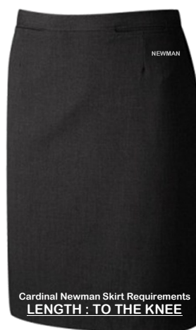
Black Straight Skirt Back Vent DL969 BADGED.