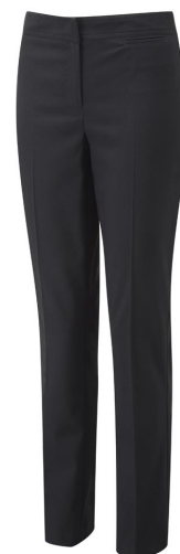
Black, Straight Or Boot Leg Trousers.