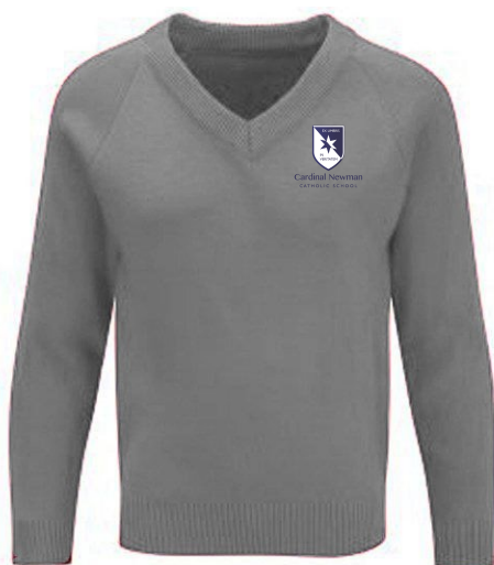
Mid Grey V-Neck 50/50 Mix Jumper Embroidered School Badge.