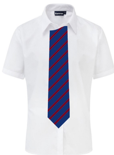
Top Button Blouse White Long Sleeve Or Short Sleeve. Twin Pack