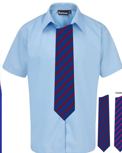
Top Button Blouse Light Blue Long Sleeve Or Short Sleeve. Twin Pack Year 7 RED Stripe Tie