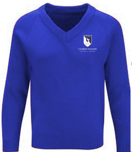
Royal Blue V-Neck 50/50 Mix Jumper Embroidered School Badge.