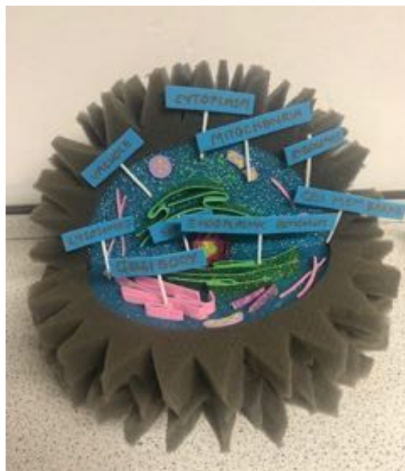
Blue and Grey Animal Cell Model - Harri Barlow Fisher (Year 7)