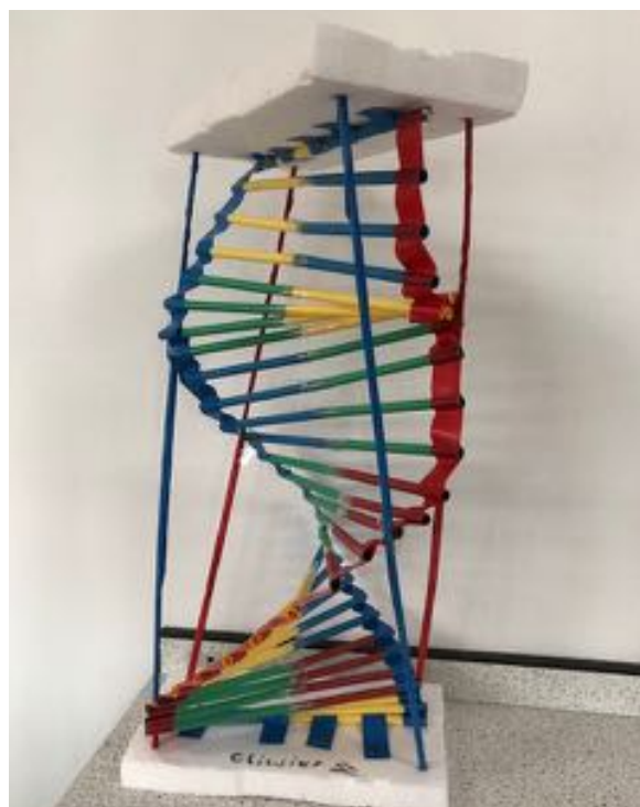
DNA model - Oliwier Szczerbinski (Year 9)