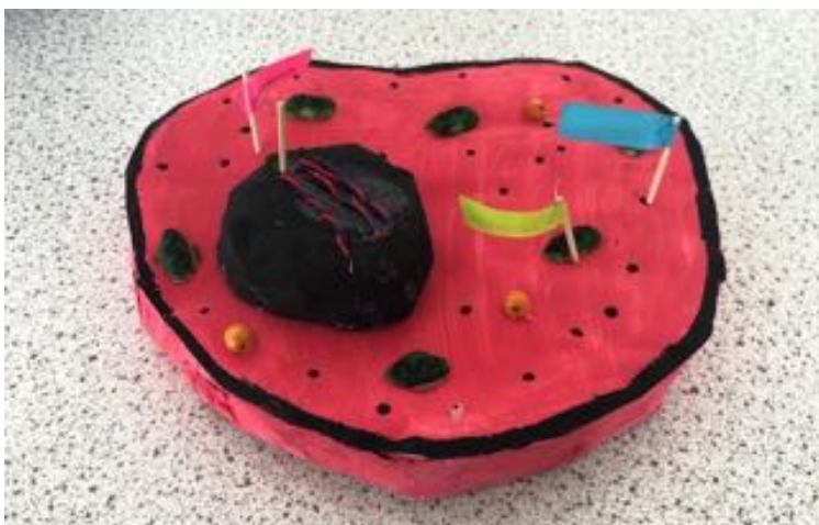
Red Animal Cell Model - Arioeh Shahzad (year 7)