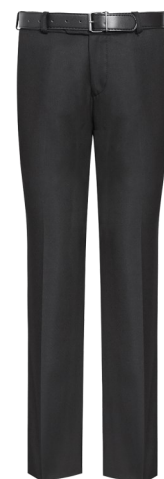
Black Pleated Trousers.