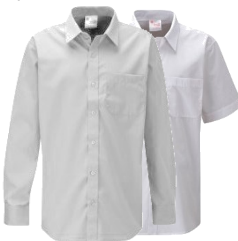
White Shirt Twin Pack Long Sleeve Or Short Sleeve.