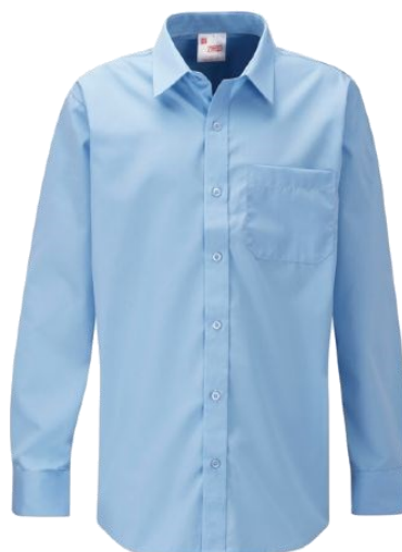
Light Blue Shirt Twin Pack Long Sleeve Or Short Sleeve.