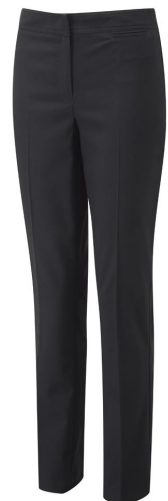
Black, Straight Or Boot Leg Trousers.