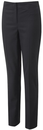
Black, Straight Or Boot Leg Trousers.