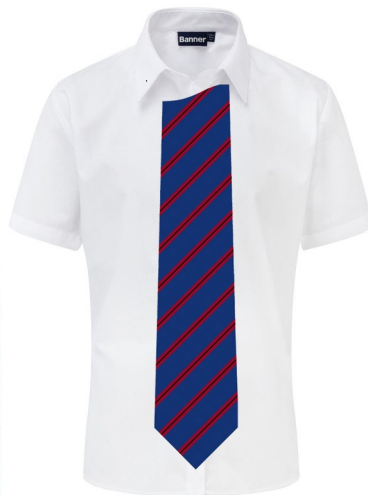
Top Button Blouse White Long Sleeve Or Short Sleeve. Twin Pack