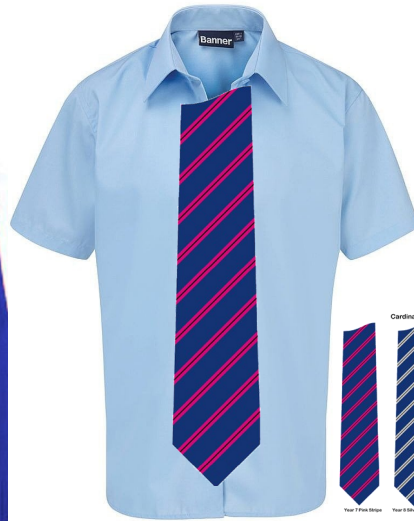
Top Button Blouse Light Blue Long Sleeve Or Short Sleeve. Twin Pack Year 7 Pink Stripe Tie