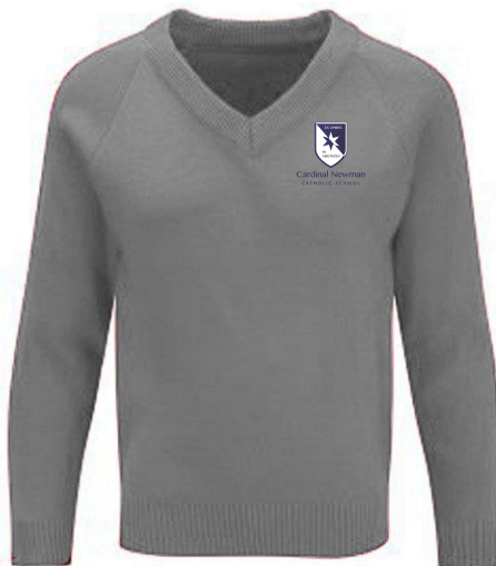
Mid Grey V-Neck 50/50 Mix Jumper Embroidered School Badge.