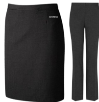
Black Straight Skirt Back Vent DL969 BADGED. Or Black, Straight Or Boot Leg Trousers.